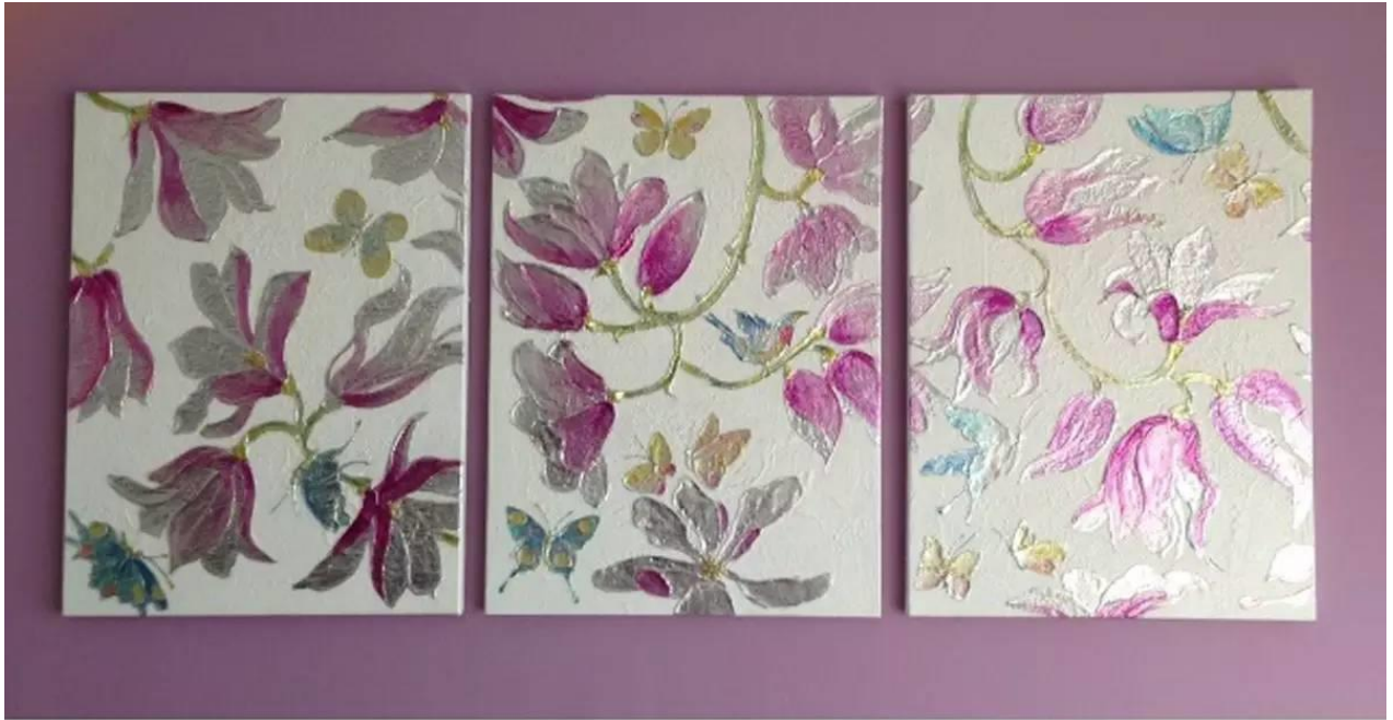
Singapore luxury - high-end custom interior design