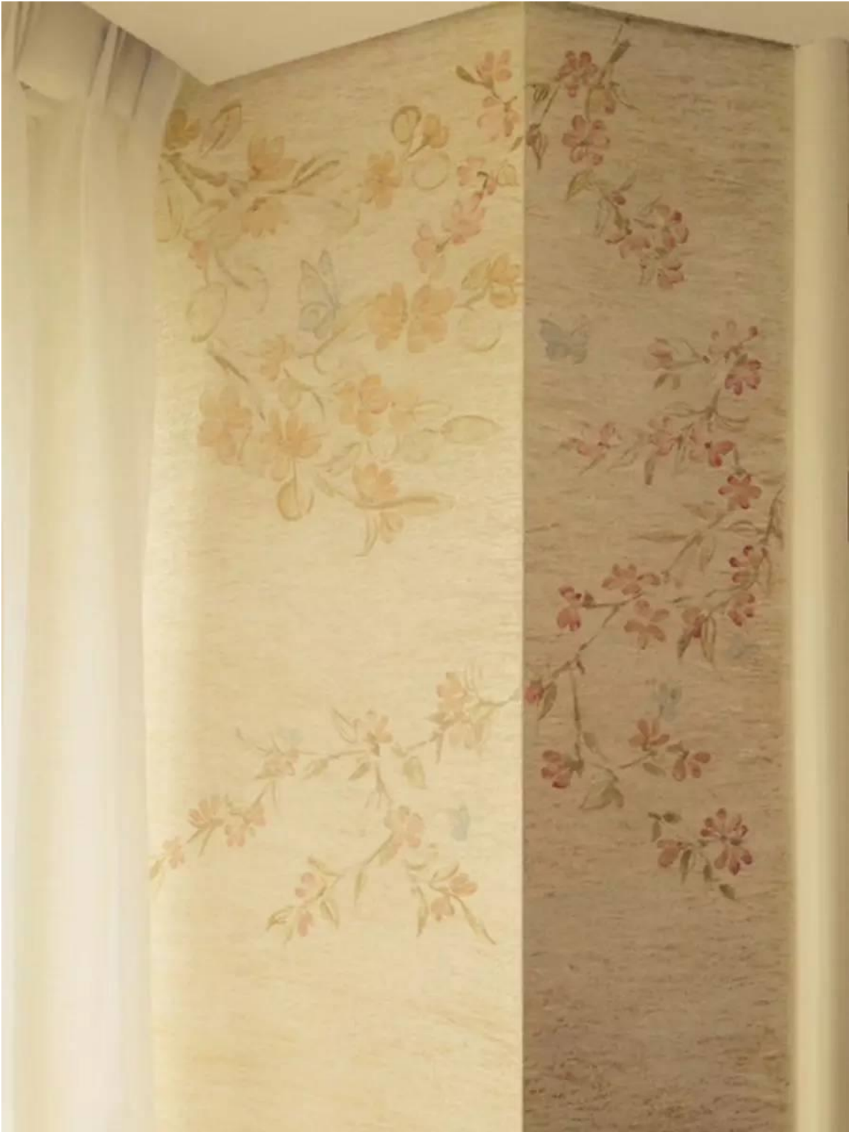
Custom hand-painted painting - 180 cm high, 90 cm wide inlaid silver flower painting