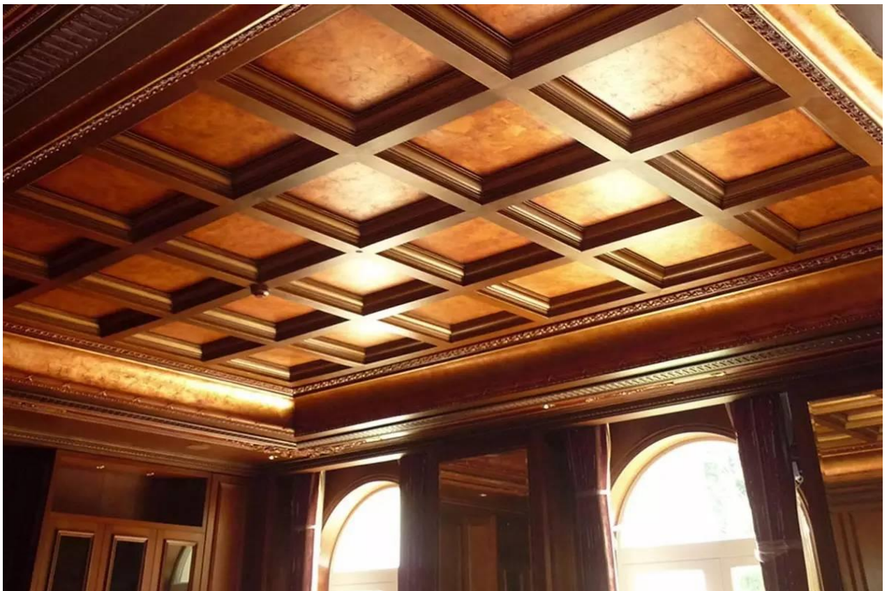
Melbourne mansion - hand painted wall art