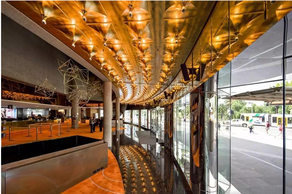
Perth Casino Front Desk - Three-piece gold-plated backdrop designed by laser cutting