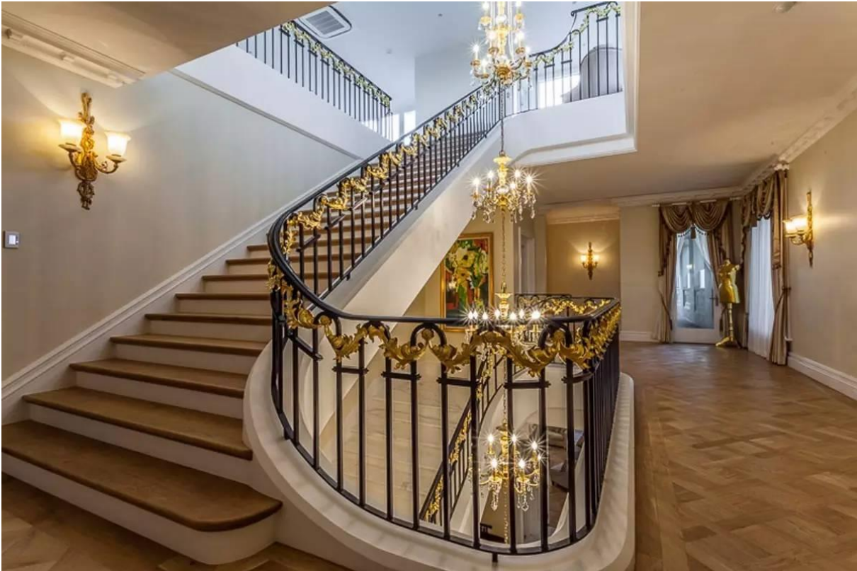
Gold and silver inlaid classical elements works